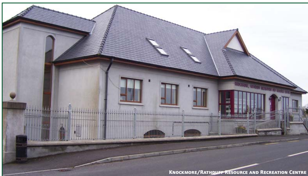
KNOCKMORE/RATHDUFF RESOURCE AND RECREATION CENTRE

Your local Fianna Fáil representatives are proud to have been associated with the ongoing growth and expansion of the centre and the ever-increasing range of services being made available to the people of the parish.