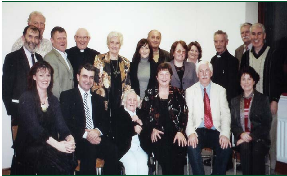
DARA CALLEARY TD OFFICIALLY LAUNCHED THE RURAL TRANSPORT INITIATIVE IN DECEMBER 2007